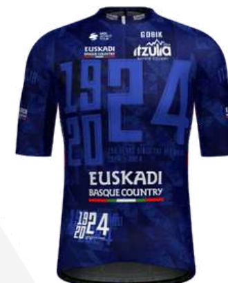
JUAN AYUSO UAE TEAM EMIRATES