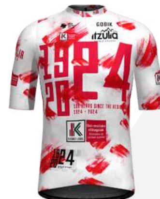
SEPP KUSS VISMA LEASE A BIKE