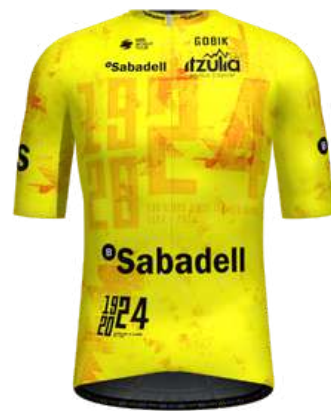
JUAN AYUSO UAE TEAM EMIRATES