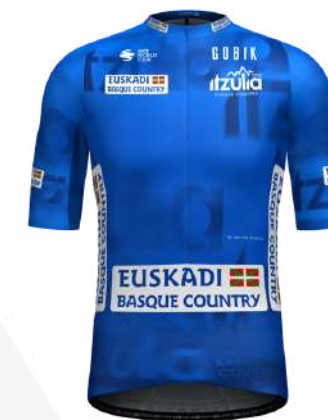
BRANDON MCNULTY UAE TEAM EMIRATES