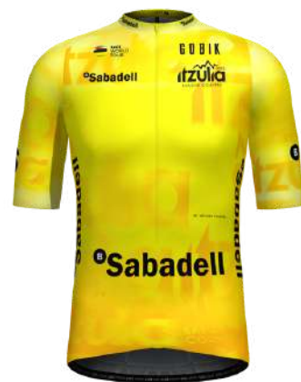
JONAS VINGEGAARD JUMBO VISMA