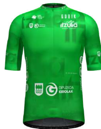
JONAS VINGEGAARD JUMBO VISMA